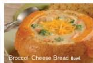
Broccoli Cheese Bread Bowl