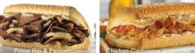
Prime Rib & Peppercorn